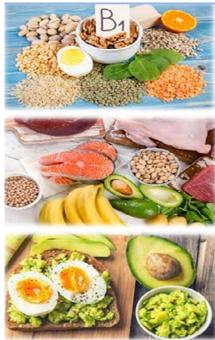
Figure 2: Vitamin B Source Internet Google Search Engine.

Vitamin C: Food items are essential for a man to sustain his health condition. If a person suffers from diabetes they would not get cured immediately. Then the doctors will advise taking Vitamin C Tablets to supply the Vitamin C to the body then the wounds will get cured with speed. Hence Vitamin C food is also very much essential for the body. Which consists as follows