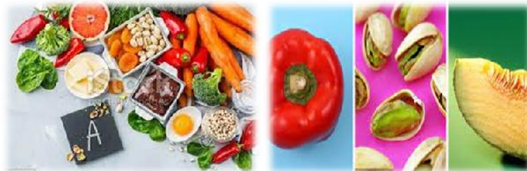
Figure 1: Vitamin A Contained Food 8248 items.

Vitamin A: Foods are Carrots, Tomatoes, Red Pepper, Milk, Papaya Fruits, Cereals, etc., if you take 900mg it reduces the diseases related to age-related vision, cancer, night blindness, etc.