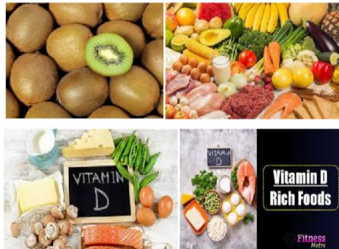
Figure 4: Vitamin D: Food defects Lead to Rickets, Bone Problems, Calcium Problems, Swelling etc.,